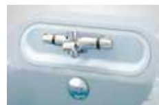
Thermostatic mixer 1/2" and 3/4"